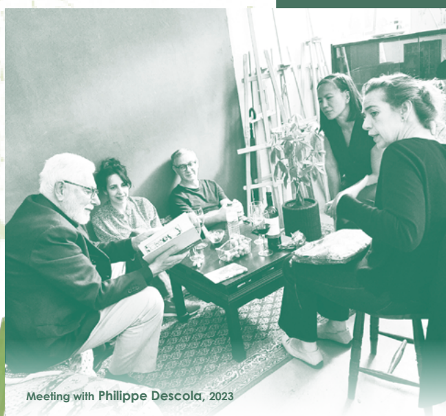
Meeting with Philippe Descola, 2023

Additionally, artist-led workshops are regularly organized for children and adults of all ages.