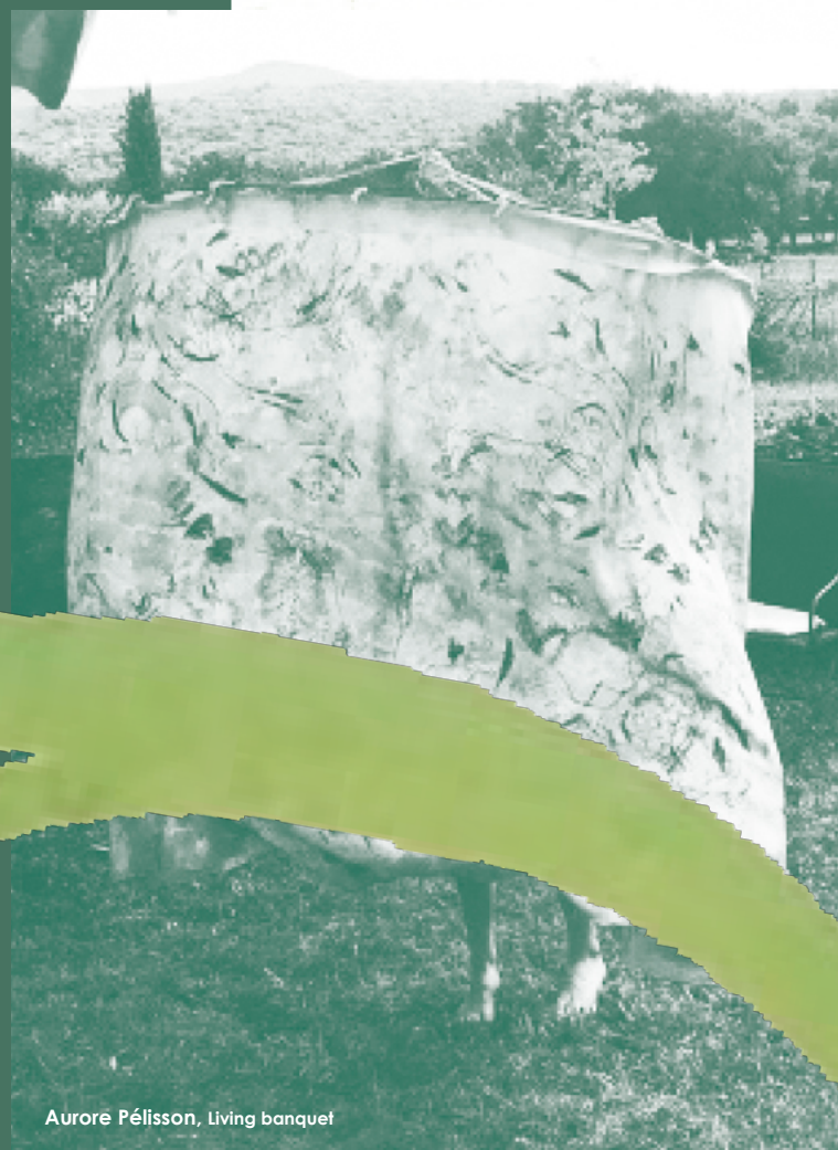
Aurore Pélisson, Living banquet